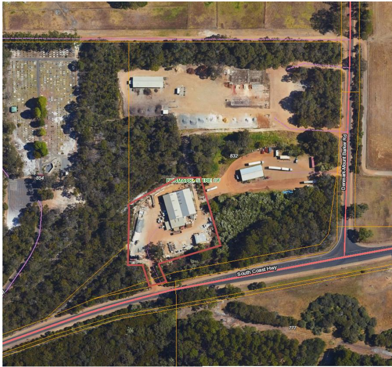
Figure 2 - Denmark Concrete lease area.