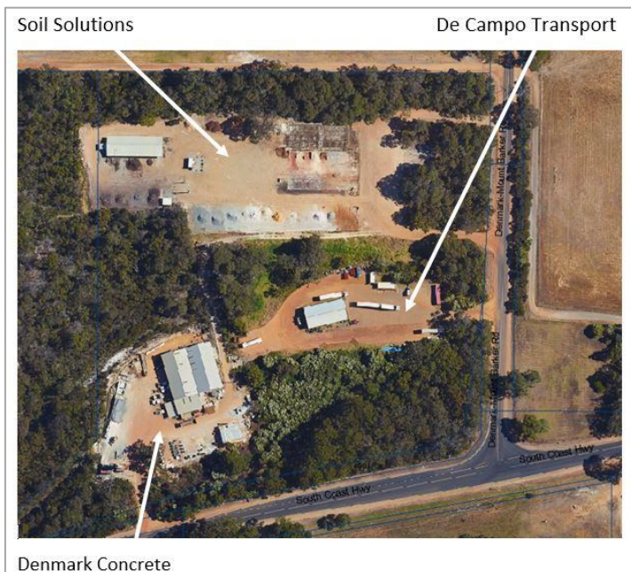
Figure 1 - Tenants of Lot 300 on DP46811