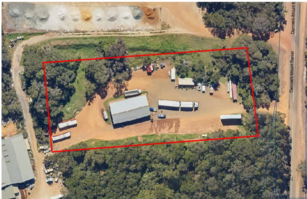
Figure 4 - De Campo Transport lease area.