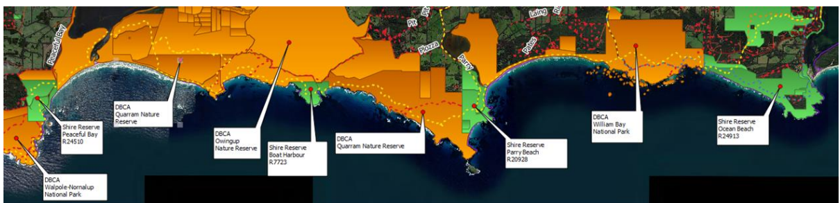
Figure 1: Coastal Reserves within the Shire of Denmark