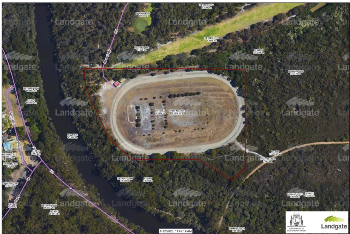
Figure 1 - 7 Beveridge Street, Denmark (delineated in red above)