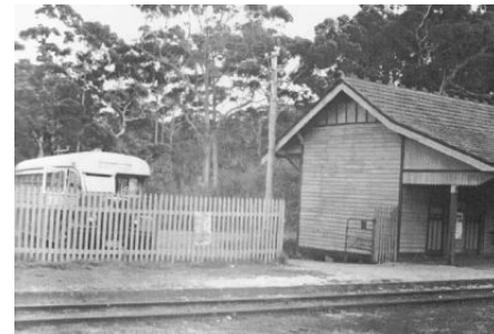
DENMARK RAILWAY STATION 1950