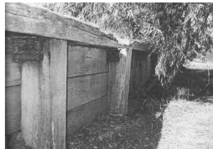
REMNANT RAILWAY RAMPS & BRIDGES