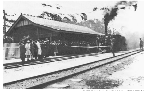
DENMARK RAILWAY STATION