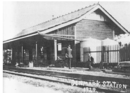
DENMARK STATION 1929