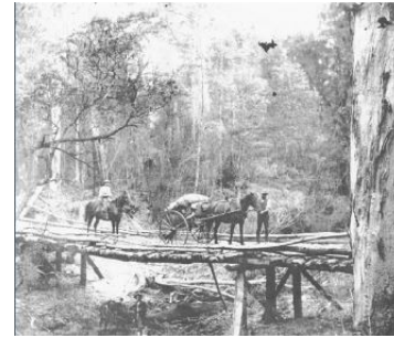
WORKMAN & HORSES