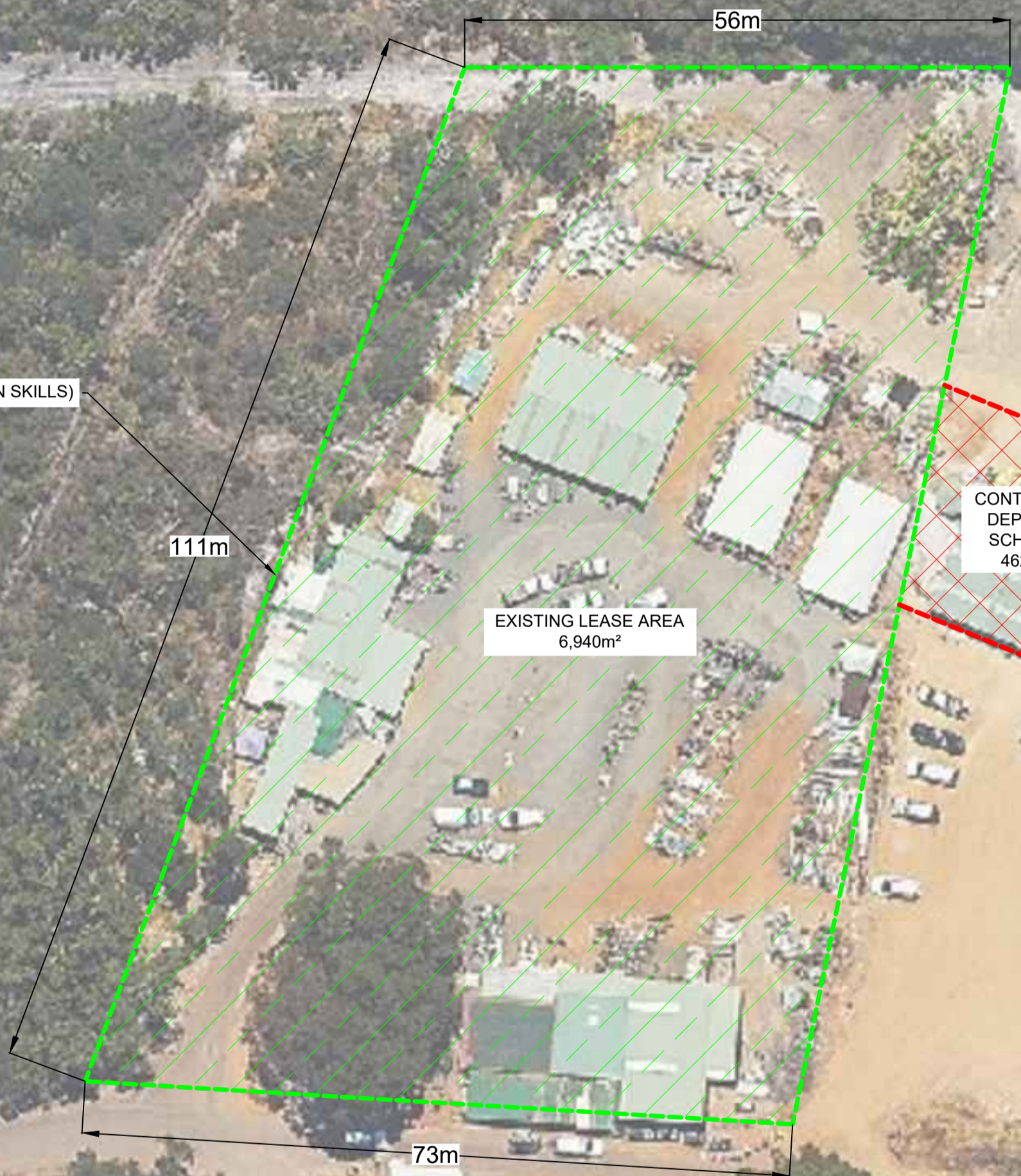
LEASE AREA - PLAN VIEW SCALE 1:500 @A1

PROPOSED LEASE EXTENSION, REFER TO BLOW UP DETAIL FOR MEASUREMENTS