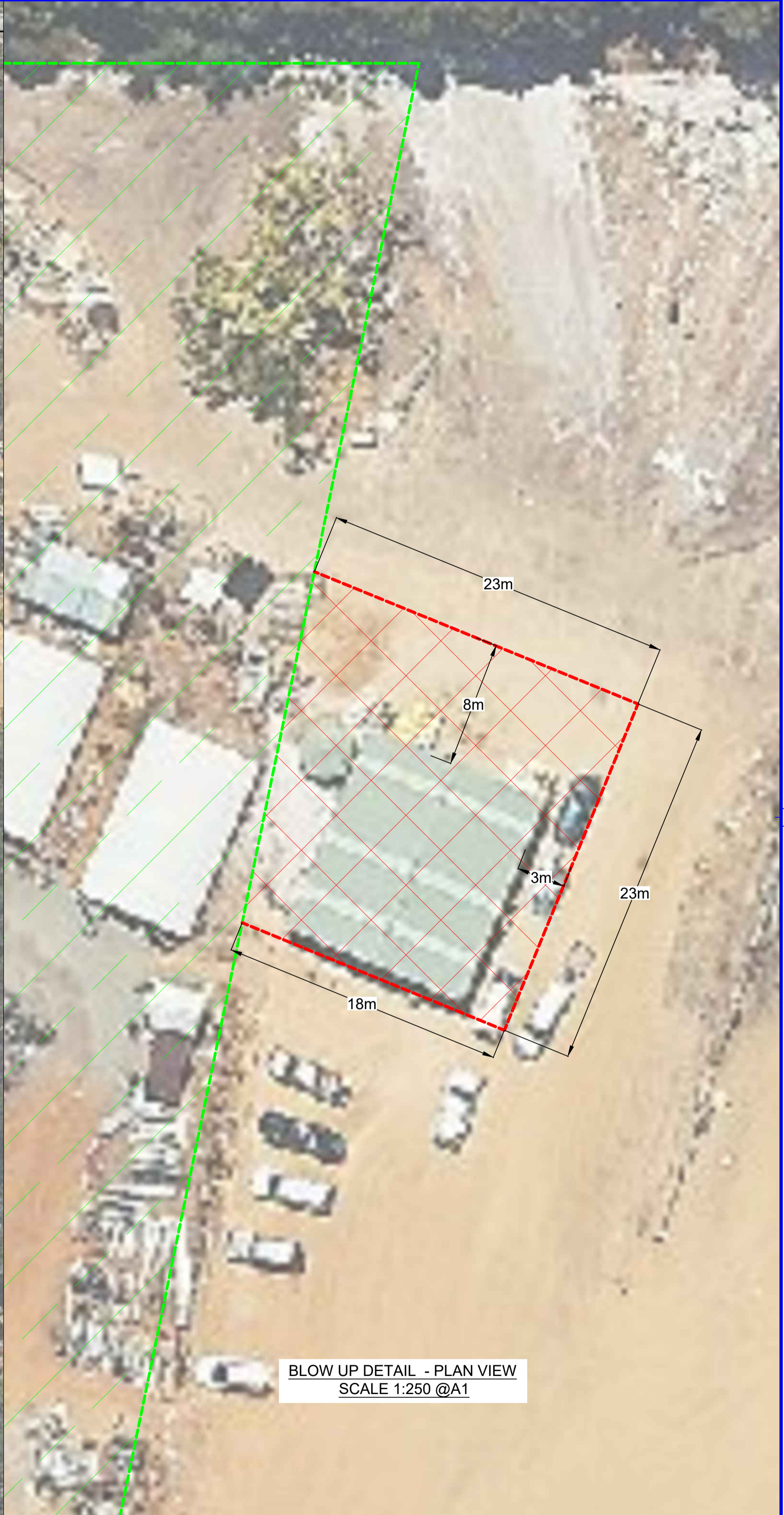
BLOW UP DETAIL - PLAN VIEW SCALE 1:250 @A1