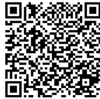
How to start a mug Library