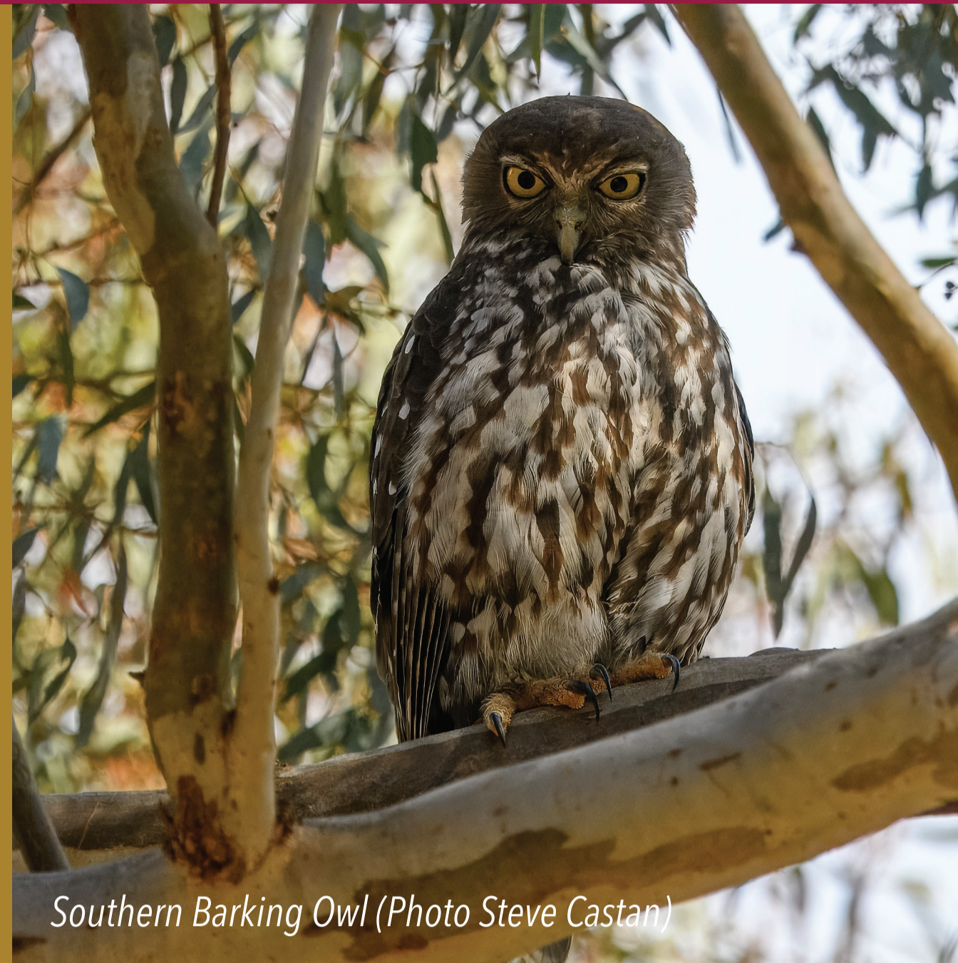
Southern Barking Owl

THERE IS A POSSIBILITY THAT THE SOUTHERN BARKING OWL IS NOW EXTINCT IN WESTERN AUSTRALIA.