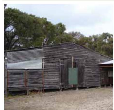
The net shed.