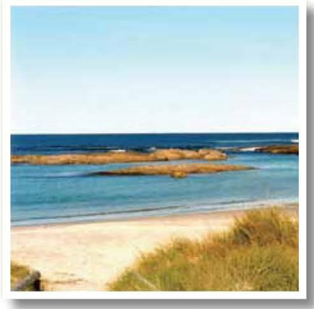
A scenic view of Parry Beach.