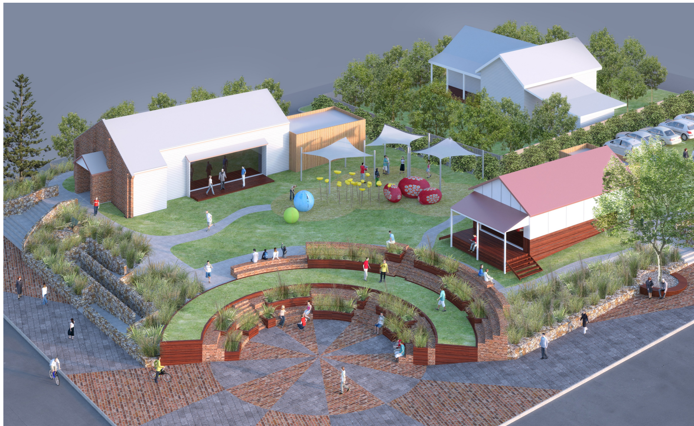
Aerial View from Cnr Strickland St & Mitchell St