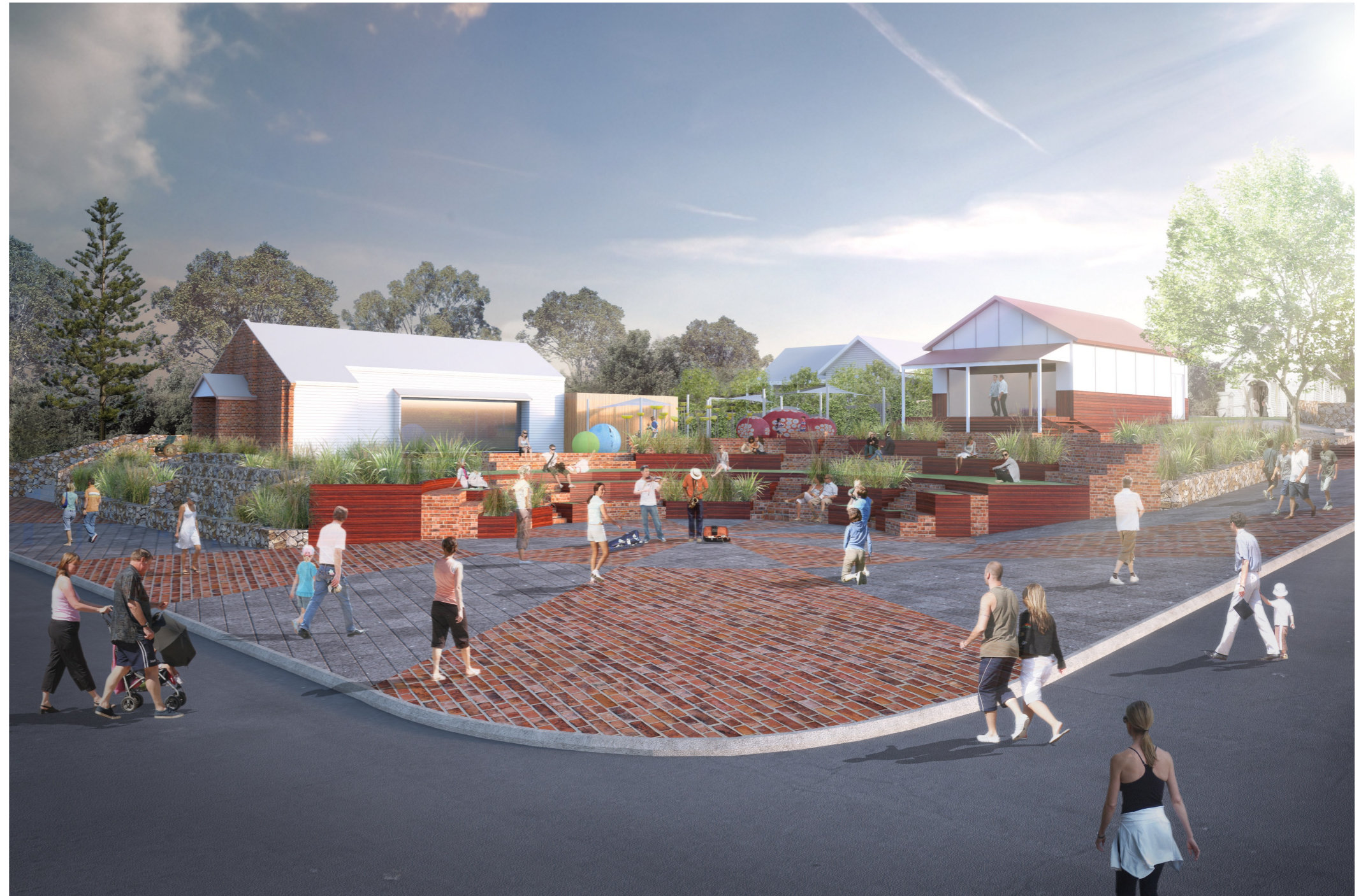
Street View from Cnr Strickland St & Mitchell St

Beyond the amphitheatre the Heritage Art Park would continue into more quiet and elevated green space protected by shade (could be shade sails or vegetation). This area could also incorporate heritage play equipment as well as sculptural art play equipment. The key idea is to create a low key family environment with respect to adjoining neighbours.